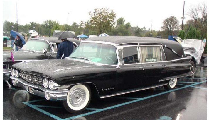
Repeat Preservation 1961 Hearse Stanley Sipko Dupont, PA