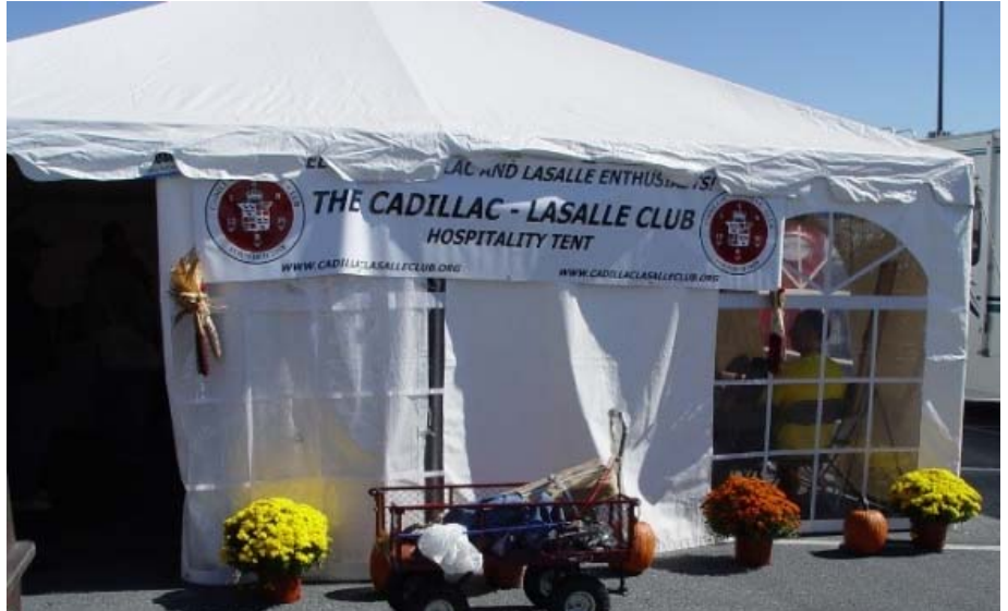
CLC Hospitality Tent

an ample supply of cold drinks and munchies. Some of the foreign visitors were pleasantly surprised and pleased with our hospitality. They were anxious to show us pictures of their Cadillacs and informed us of their restoration projects. A few of them were looking for various parts and we were able to send them in the right direction to accomplish their mission.