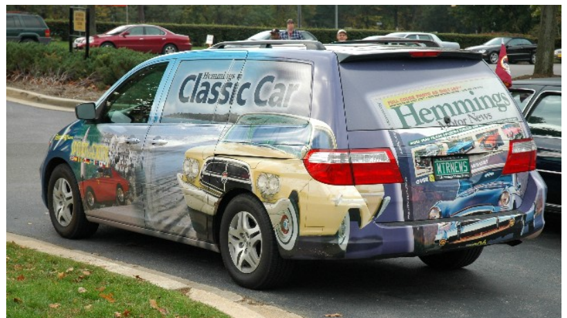
A welcomed site at any car show, the Hemmings Classic Car Van