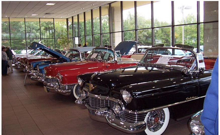
1950's Eldorados filled the showroom