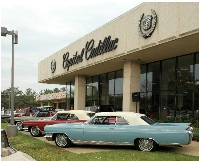
1960's Eldorados on the apron