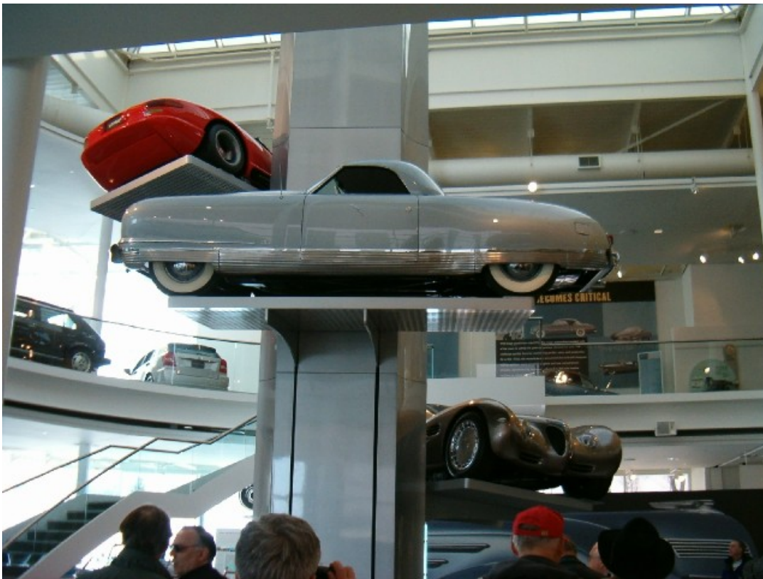
Walter P. Chrysler Museum

On Friday morning, at close to zero degrees but thankfully no snow, we loaded up in a bus and went to look at a 1960-vintage former dealership building that is one of the proposed sites for the CLC Museum. The dealership building has been used for storage since 1984, and among the cars stored there are four of the eight cars owned by the CLC Museum.