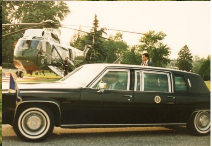
President George H.W. Bush landing and proceeding to Baltimore's Memorial Stadium Summer 1989