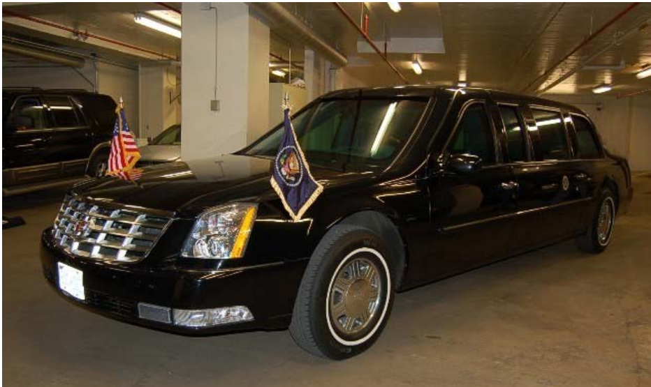
The limo majestically displays its flags

The vehicle interior boasts seating with comfort and visibility for all occupants. A rear seat executive package features a concealed, foldaway desktop that can be deployed when conducting affairs of state. The rear seats have an adjustable reclining feature along with the adaptive seat system, which senses the position of the occupant in the seat and automatically adjusts the cushion for added comfort. Wood accents, rich blue leather and cloth complete the executive interior.