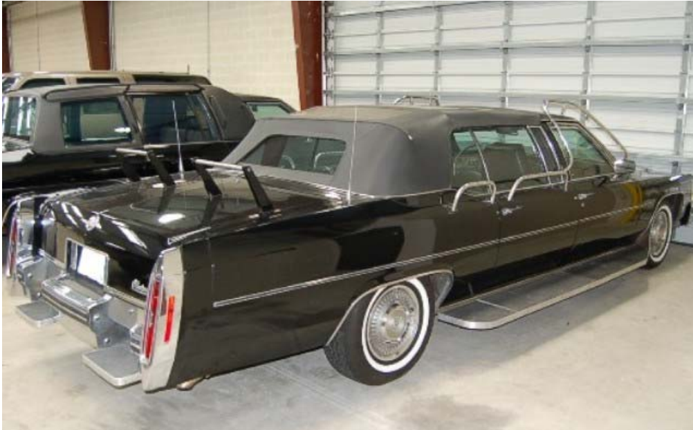
Out-of-service Cadillac Limos used for training