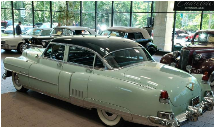
Gary Bacon's 1953 Fleetwood 60 Special