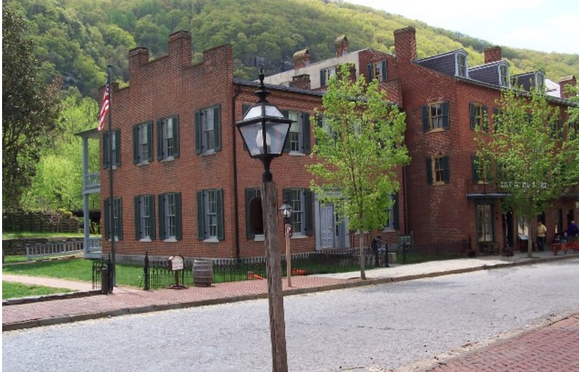
Historic Harpers Ferry West Virginia