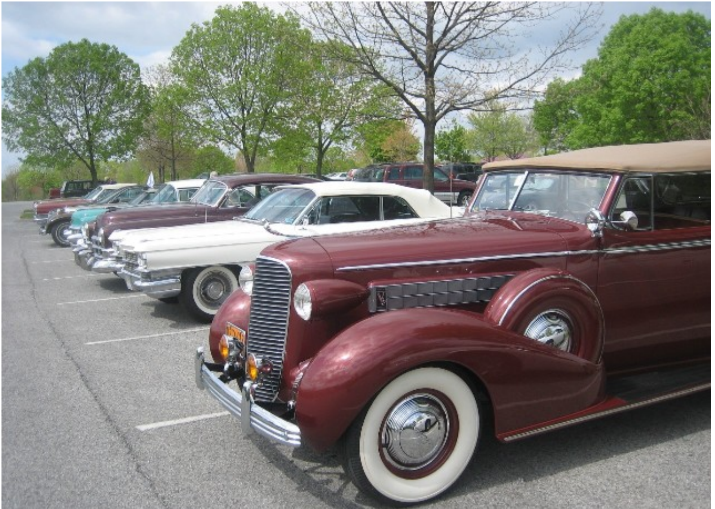
The 1930's – 60's were well represented