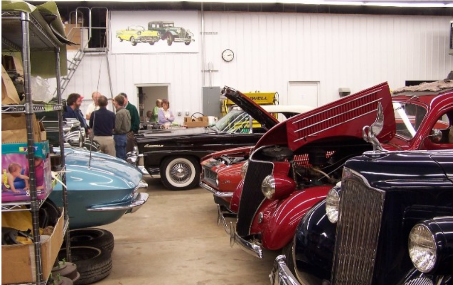
Eclectic mix of cars in different stages of restoration