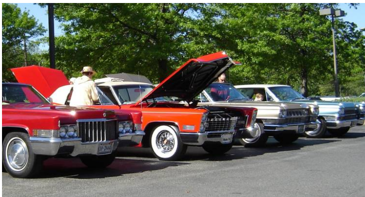
Pick one...any one