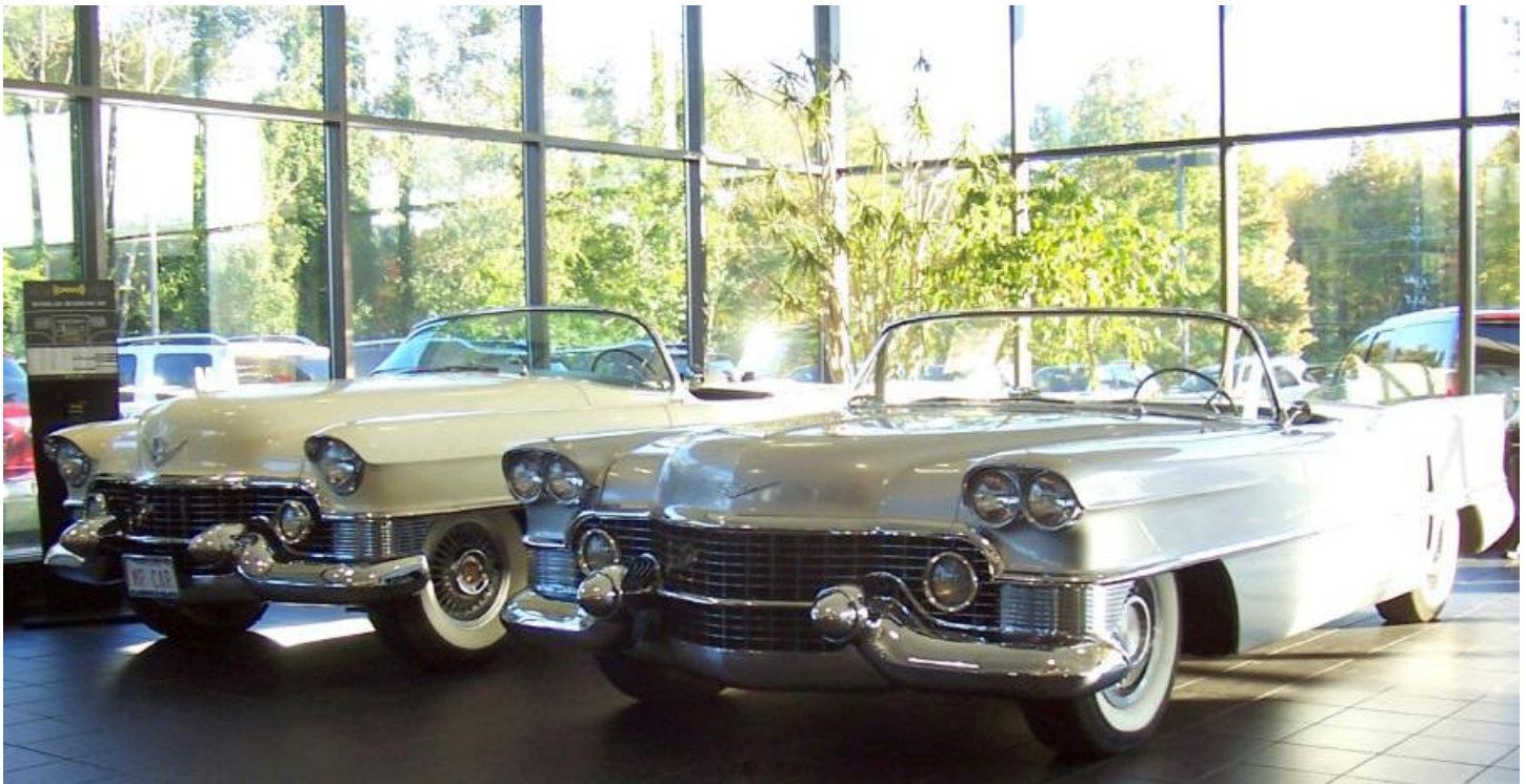
1953 LeMans #3 (left) and 1953 LeMans #4 (right) together for the first time ever!