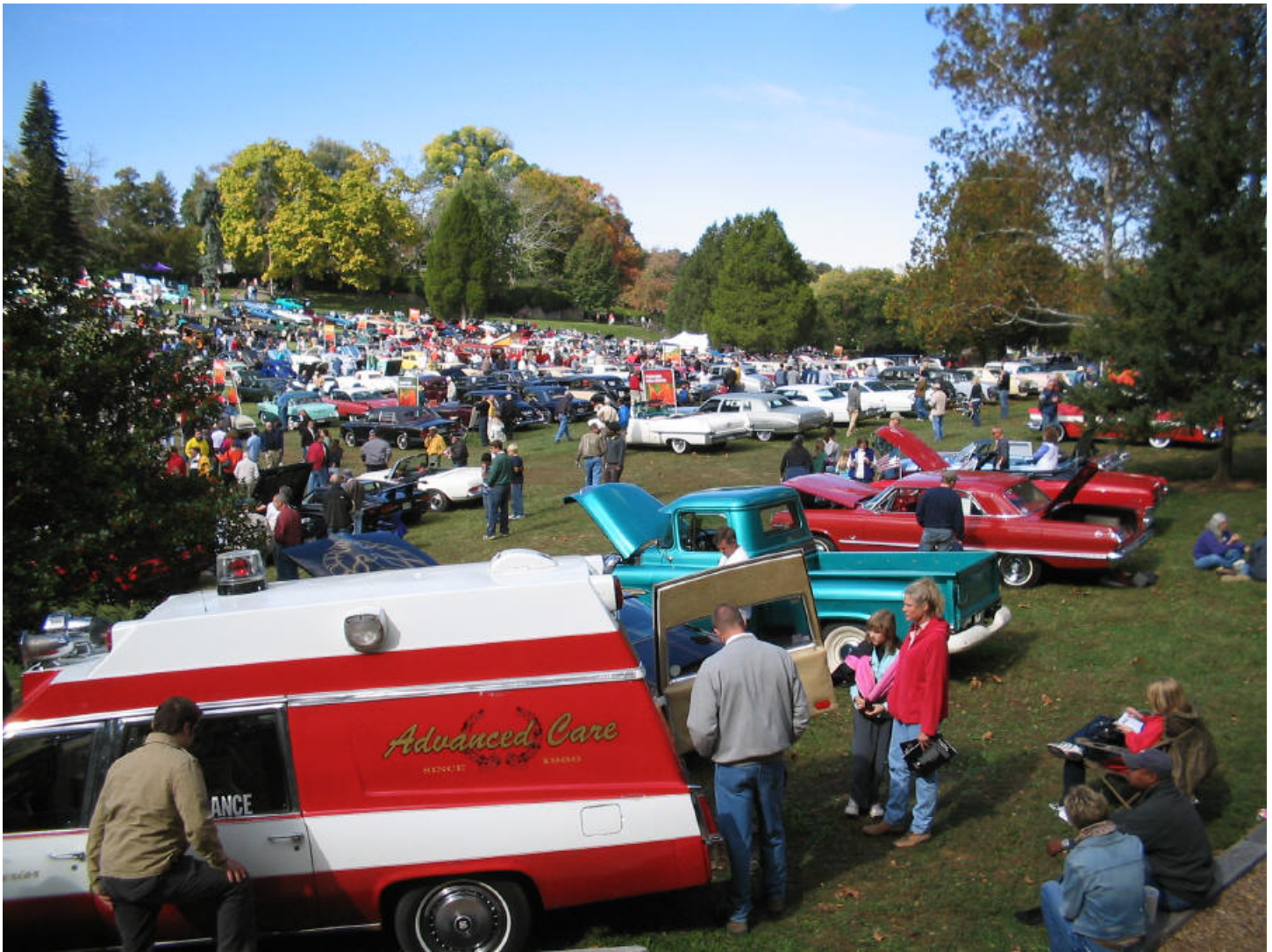
Full house at the Rockville show

2008 CITY OF ROCKVILLE ANTIQUE & CLASSIC AUTO SHOW STORY BY STEVEN SISSON