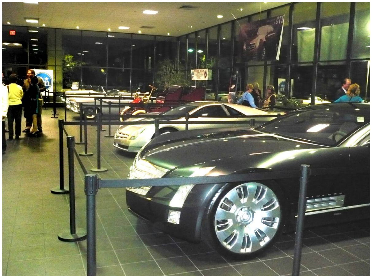
From foreground to background: 2003 Sixteen, 2002 Cien, 1903 Cadillac, LeMans #4, and LeMans #3

Aside from seeing the superb LeMans sisters (numbers 3 and 4), the beautiful 1956 Motorama Cadillac Maharani (the kitchen sink Cadillac) show car, the historic 1903 Cadillac, the "Centennial" Cien show car, and the fabulous Cadillac Sixteen, three major highlights occurred for me at the show that I simply must share in