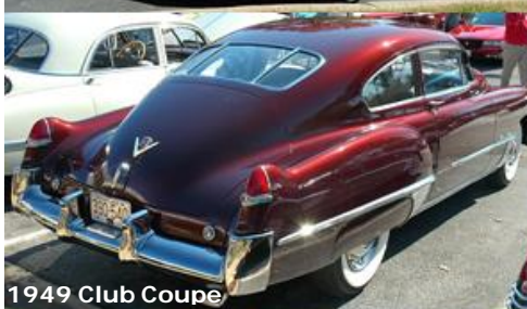
1949 Club Coupe