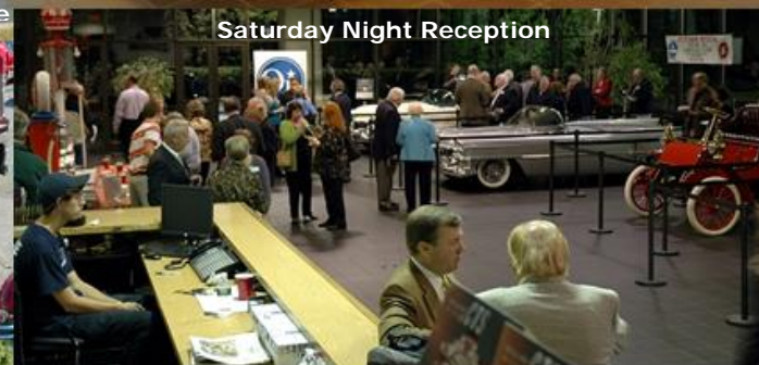
Saturday Night Reception