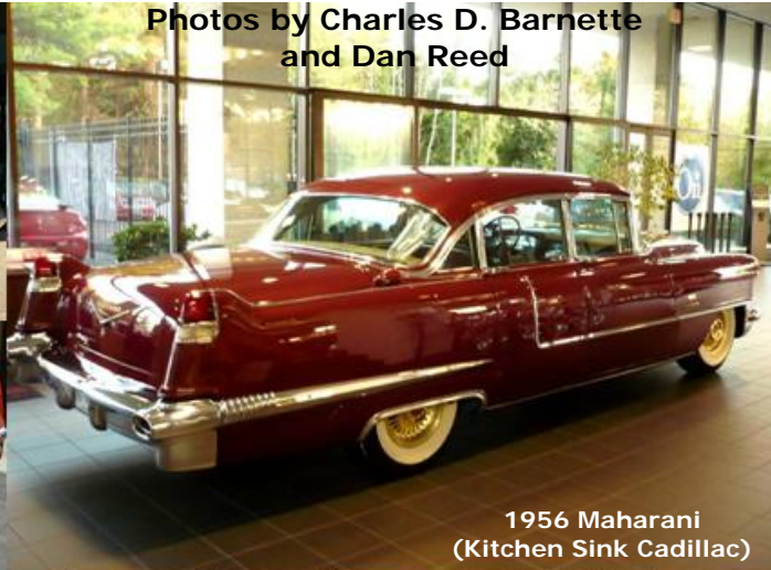
1956 Maharani (Kitchen Sink Cadillac)