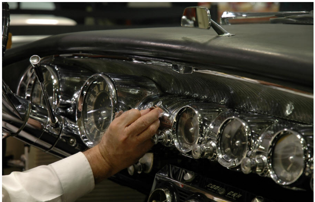
A perfect fit!