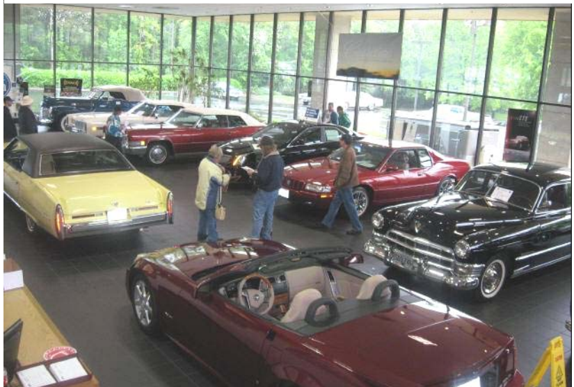
Not just hardtops ventured out in the rain – five convertibles were in the showroom!