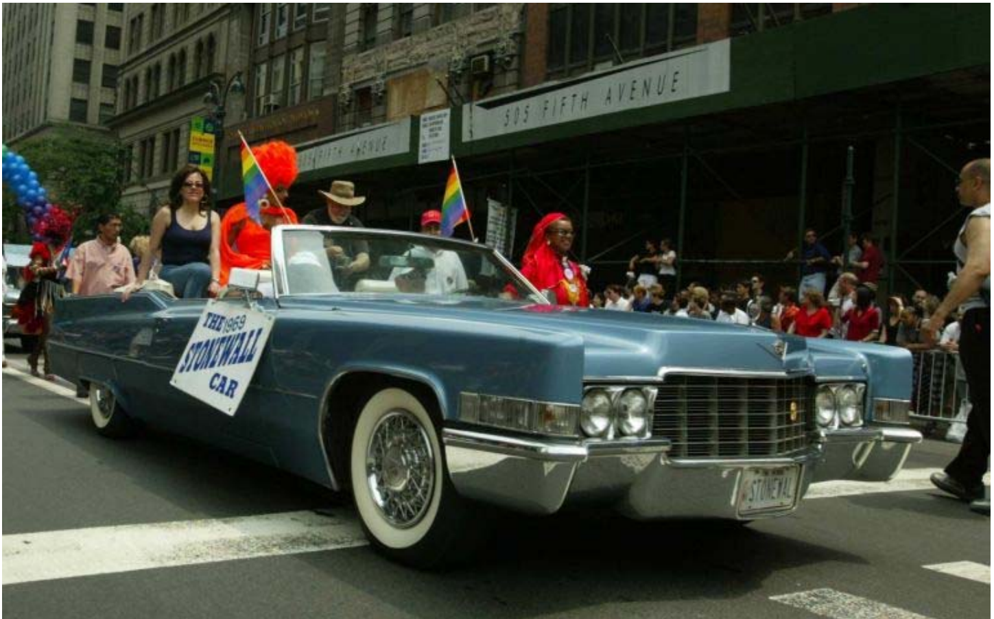
The Stonewall Cadillac leading the New York City Gay Pride Parade June 2003