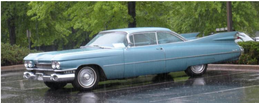
Sandy Kemper's 1959 Coupe Deville celebrates its golden birthday with a nice wash!