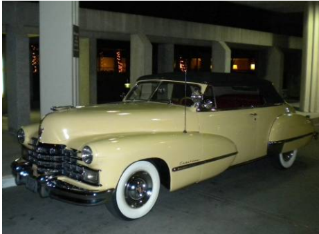
1947 Series 62 Convertible