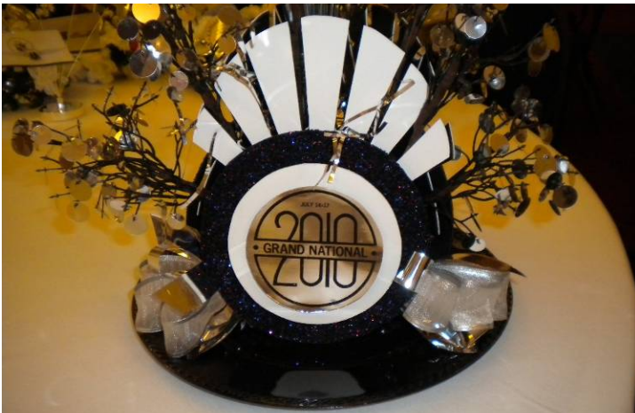
One type of table decoration

Cocktail hour started at 6:00 PM in the corridor outside of the banquet room. Six bars were set-up to accommodate the large crowd. Once the doors sprung open, people entered quickly to the tables that they reserved earlier in the week. Awaiting them at each table was a specially-made table decoration. Entertainment during dinner was a Jazz ensemble that included an excellent singer who sang some timely classics.