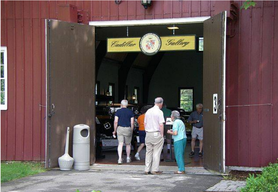
Entrance to the Cadillac Gallery

CLCMRC CADILLAC GALLERY NOW OPEN! PHOTOS & STORY FROM CLC WEBSITE