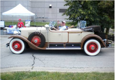
1929 Sport Phaeton