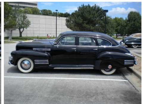
1941 Series 63 Sedan

On Friday, I attended the CLC Board of Directors meeting. It was great to hear about all the things in the works for the club short-term as well as long-term. For anyone who hasn't had an opportunity to attend one of the meetings, I would highly recommend it. They are open to all members and participation is encouraged.