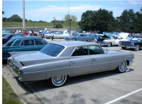
1963 Park Avenue