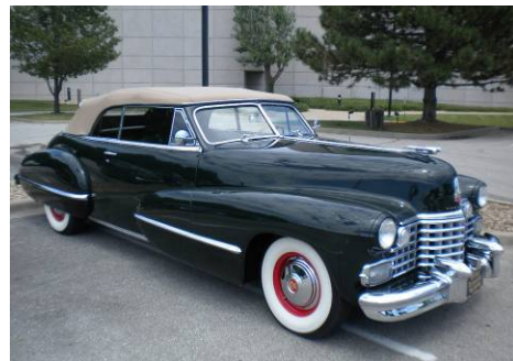
1942 Series 62 Convertible