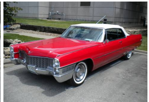
1965 Deville Convertible