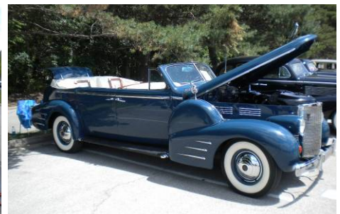
1938 Series 75 Convertible

Visit us on the web! www.clcpotomacregion.org