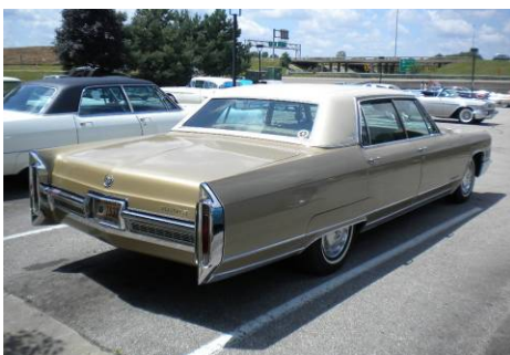
1966 Fleetwood Brougham