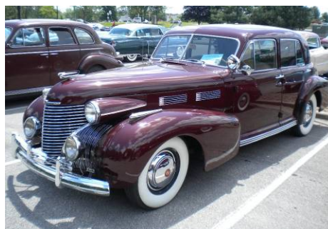
1940 Series 60 Sedan