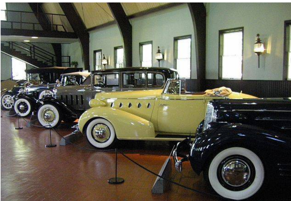
Just a sampling of the Cadillacs and LaSalles on display

The Cadillac Gallery, the new home of the CLCMRC, is now in operation at the Gilmore Car Museum in Hickory Corners, MI. As part of their agreement with Gilmore, the CLCMRC is renting the Gilmore's Carriage House until their new museum building is constructed.