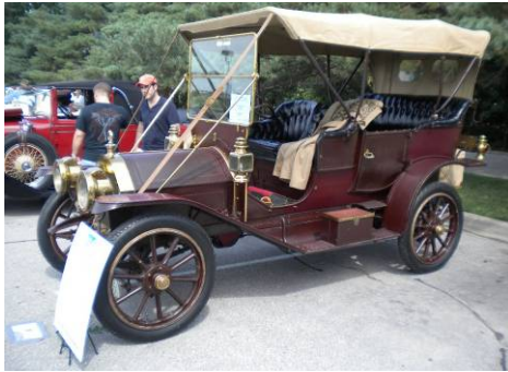
1910 Series 30

Some of my favorite cars at the Grand National!