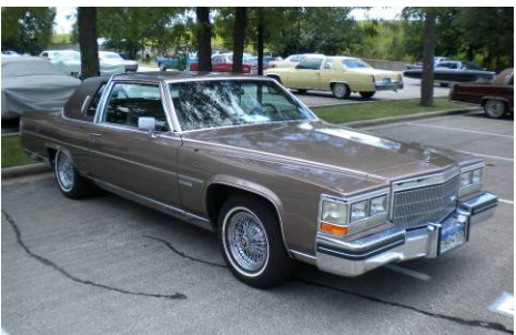
1983 Fleetwood Coupe