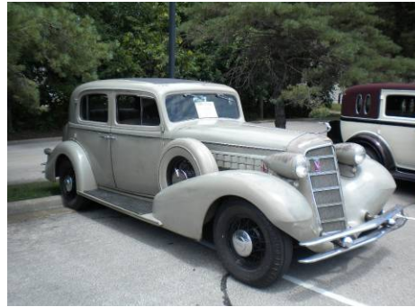
1934 Series 721