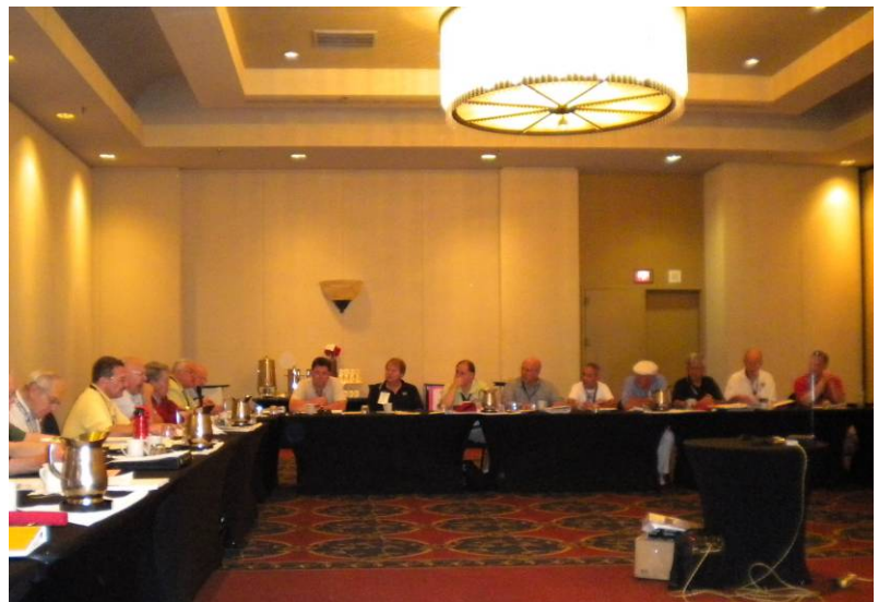
CLC Board of Directors Meeting In Progress

Friday evening produced a vicious thunderstorm. While the storm didn't last terribly long, small branches and leaves were among the puddles that formed on the show field. We later heard that the storms were isolated as members who attended the Royals baseball game didn't experience the same downpour. After the storm, which struck while at dinner at Garozzo's Italian Restaurant, we toured the show field where owners were removing car covers and drying their cars. Fortunately, that was the last rain we had during the event.