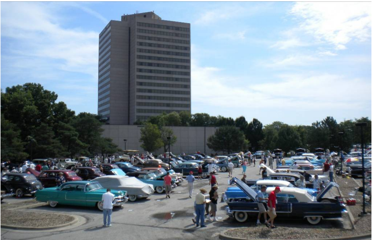
The Doubletree Hotel Overland Park-Corporate Woods, Overland Park, Kansas 2010 CLC Grand National Host Hotel