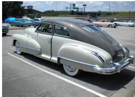
1947 Series 61 Club Coupe