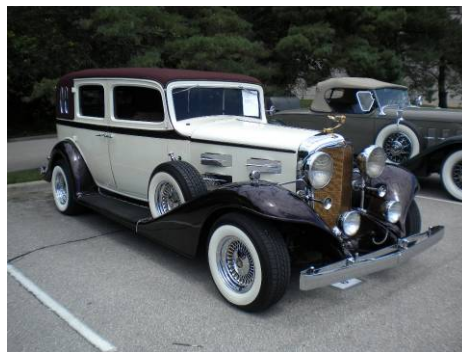
1933 LaSalle 662