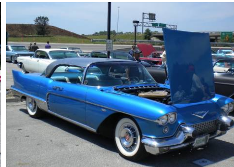
1957 Eldorado Brougham