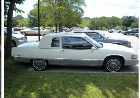
1990 Fleetwood Coupe