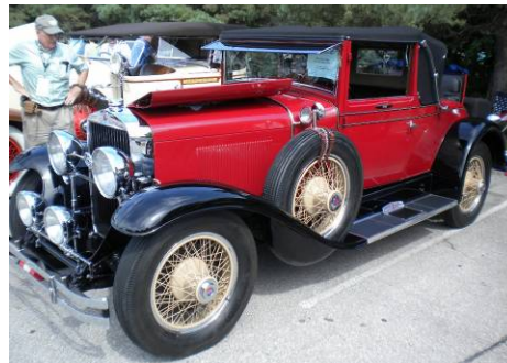
1928 LaSalle Series 8050