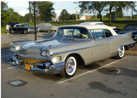
1958 Eldorado Biarritz