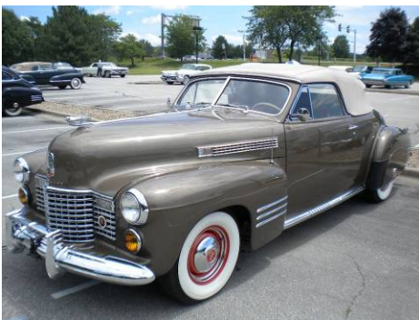
1941 Series 62 Convertible