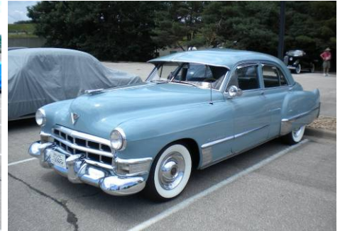
1949 Series 62 Sedan