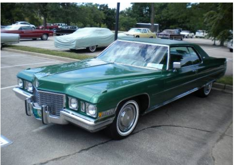
1972 Coupe Deville