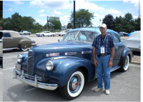
1940 LaSalle 5227 Coupe