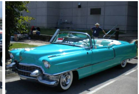
1955 Series 62 Convertible