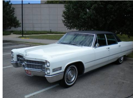
1966 Sedan DeVille