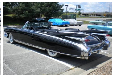
1959 Eldorado Biarritz