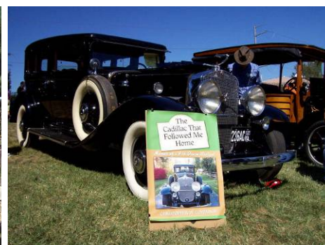
The Cadillac That Followed Me Home at the Edgar Rohr Memorial Show Manassas VA

Visit http://www.clcpotomacregion.org/2010pictures.htm to see more pictures from these two events.