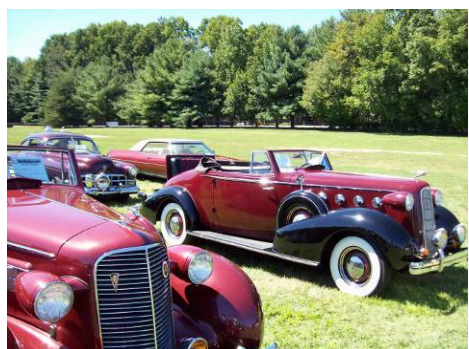
A favorite color of CLC cars at Vern Parker's Street Dreams Show McLean VA