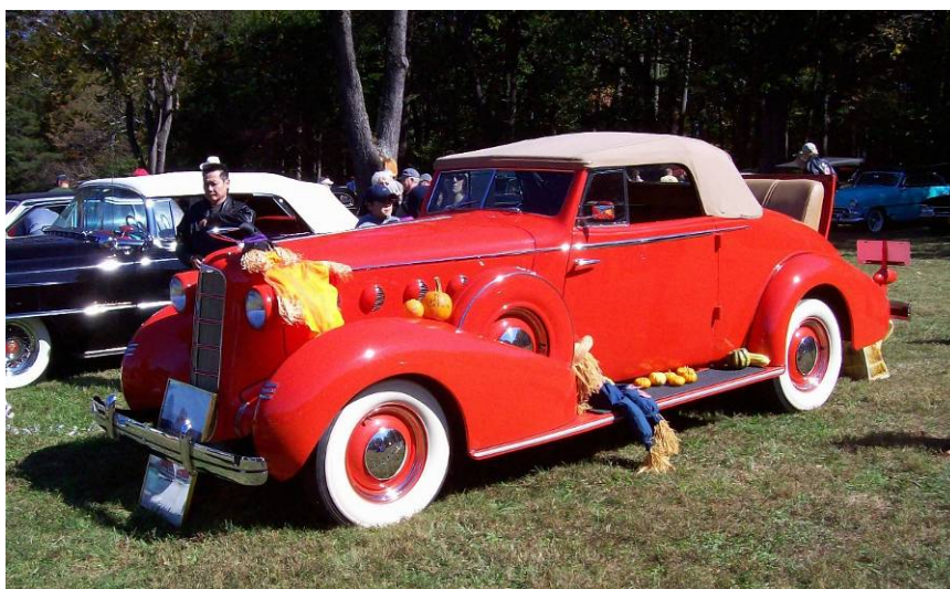
Randy Denchfield's 1935 Convertible Coupe

Nevertheless, there were plenty of Fords, Chrysler products, Chevrolets of every type, Buicks, Pontiacs, Oldsmobiles, Studebakers, Hudsons and other makes delighting the estimated crowd of over 5,000 spectators.