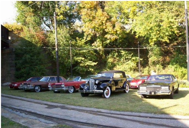
Cadillacs at the Streetcar Museum

Fabulous Fleetwoods was a great show, not just for the Potomac Region, but for the many CLC members who participated. Although not billed as such, Fabulous Fleetwoods became an inter-regional event comprising both days of a spectacular fall weekend. On Saturday October 23rd, members of the Valley Forge Region drove their Cadillacs from the Greater Philadelphia Area to the Baltimore Streetcar Museum in the City of Baltimore. There they were met by a group from the Potomac Region for an informal car show. The tour goers spent the sunny and clear afternoon hours riding the historic trolleys and taking tours of the streetcar restoration shops and museum.