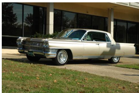
Henry Sittner's 1964 Fleetwood Series 60 Special