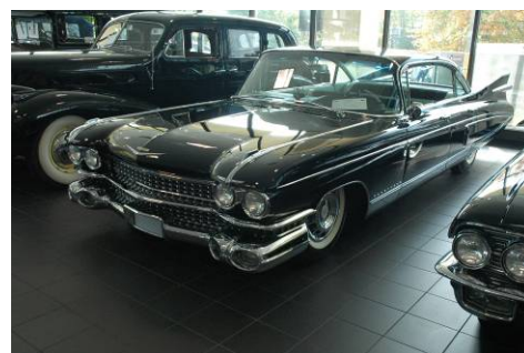
Dave & Dora Forry's 1959 Fleetwood Series 60 Special