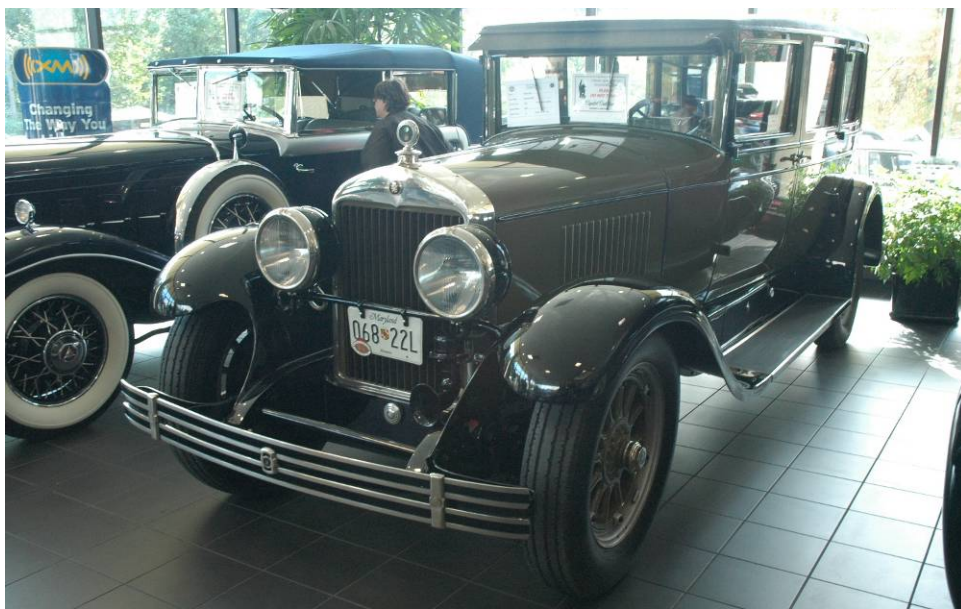
David Lewis' 1927 Cadillac Sedan Model 314, the oldest car present at the show