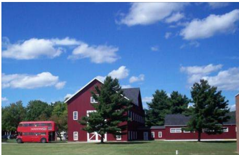
Gilmore Car Museum Complex Hickory Corners, MI