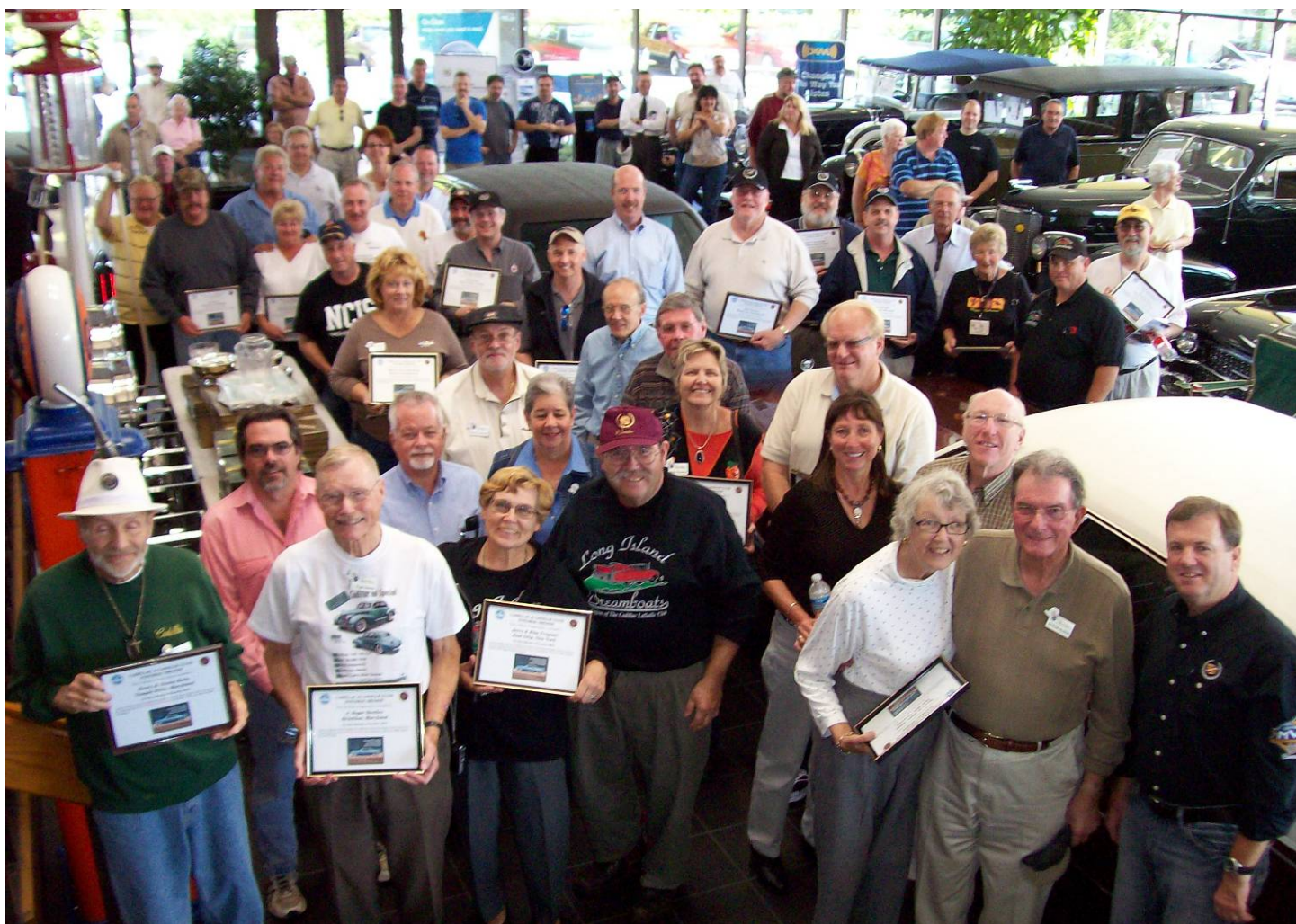
Fabulous Fleetwood Owners with their Certificates of Appreciation