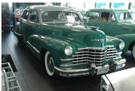
Scott Bender's 1946 Fleetwood Series 60 Special