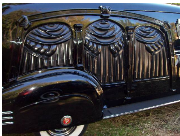
The carved wooden side of a 1941 Cadillac hearse