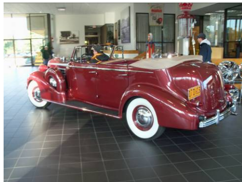
Byron & Alida Alsop's 1936 V-12 Convertible Sedan