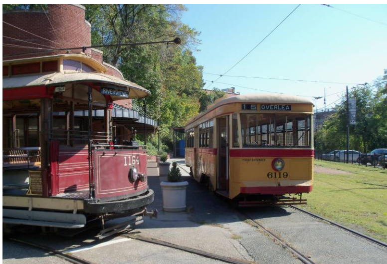
A couple of the old Streetcars at the Museum