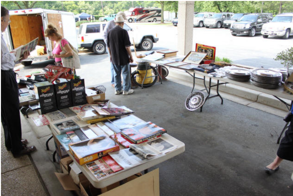
The Automobilia auction began thirty minutes early due to the higher than usual number of items available. The auction raised $1,727.50 for the Potomac Region.

Last but not least, it should be mentioned that another beautiful pre-war Cadillac, a 1929 Model 341 Sport Phaeton displayed by Byron and Alida Alsop, was entered for display only. To be sure, these were not the only noteworthy Cadillacs at the show. Space does not permit discussion of all of them, and I am certain this short list omits many that deserved greater mention.