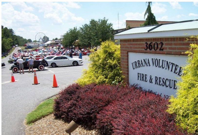
Urbana Volunteer Fire & Rescue recently hosted another car show

On Sunday, September 11th, the AACA Sugarloaf Mountain Region (SMR) will hold its 42nd Anniversary "Activities Meet and Antique Car Show." This long-running show used to be held in Mt. Airy, Maryland. But this year the SMR has moved the location to Urbana Volunteer Fire and Rescue Department grounds in Urbana, Maryland. This new site is simple to find and it's an easy drive. It's just off I-270 (Exit 26) on Urbana Pike (MD Route 355). Of important note for our club, the featured marque for this year's show will be Cadillac. This includes all Cadillacs through 1986. What an opportunity for us to show off the " Standard of the World! "