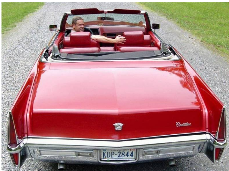
Follow Scot to the fine vineyards of Virginia

The photo caption above is just figuratively speaking as Tom will lead the way. Barrel Oak Winery is also a relatively new winery with an excellent product, and it features spectacular views from its expansive patio. Incidentally, this winery employs a geothermal heating and cooling system I designed for them a few years ago.