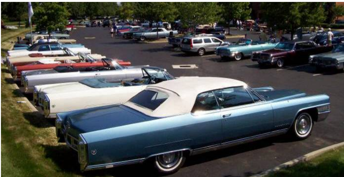
A sea of Cadillacs and LaSalles at the Grand National