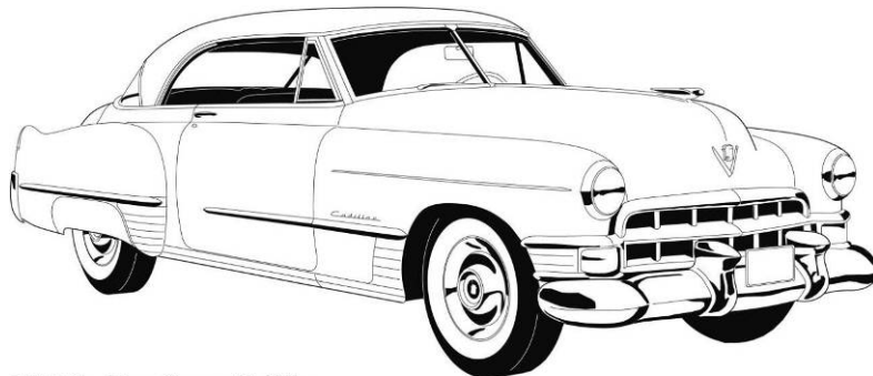
1949 Cadillac Coupe DeVille

Following in the tradition of celebrating a theme at the Annual Fall Car Show at Capitol Cadillac, this year's theme will be Dazzling DeVilles . Specifically, DeVilles from the model years 1949-1970 will be the honored cars at the show to be held on Sunday October 30th in Greenbelt, MD. These were among Cadillac's most popular models during the period when Cadillac became the undisputed sales leader in the luxury car market.