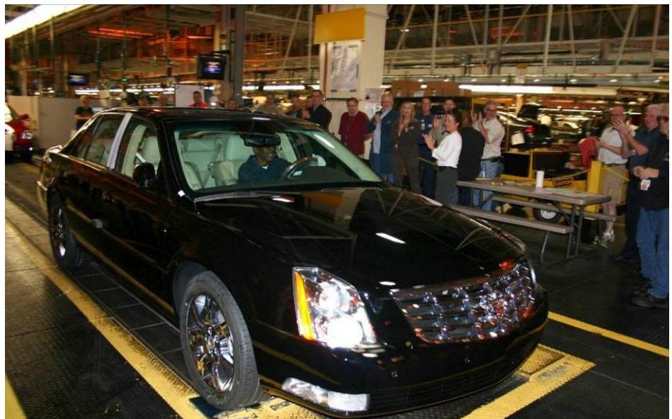
General Motors employees applaud as the last Cadillac DTS sedan, a beautiful black 2011 model, arrives at the end of the Detroit-Hamtramck Assembly Plant

In May 2011, the DTS was discontinued permanently, as was its smaller brother, the STS. Even in its last full year of production, the DTS outsold all other large luxury cars in the United States, including the Mercedes-Benz S-Class, BMW 7-Series, Lexus LS430 and Lincoln Town Car. A stretched version of the DTS serves as the U.S. presidential limousine. The last DTS to roll off the assembly line was a black car destined for the collection of well known car collector Nicola Bulgari, a fitting conclusion for a proud model.