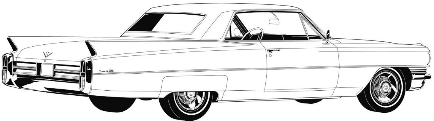
1963 Coupe DeVille Illustration by Bob Eng

In 1962 and 1963, there was yet a third version of the Sedan deVille, also offered at the same price. That was the Park Avenue, a short-deck version of the four window version Sedan deVille. The Park Avenue was seven inches shorter, with the difference being in the trunk area. This model was introduced to accommodate customers whose garages were too small to accommodate the longer cars, or, as the name implied, people who lived in big cities where parking spaces were tight. The idea was good, and perhaps ahead of its time, because there wasn't enough demand to continue the model, and it ended after the 1963 model year.