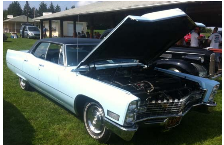
This Dazzling DeVille on display, a 1967 Sedan, is a 20k original mile AACA winner

After the ceremony, the show continued in earnest with the participants completing their ballots for the peer judging. People wandered around the show cars and flea market. Others lined up to partake in the Fire Department's locally famous fried chicken platters. Meanwhile, a cycling group began performing on their high-wheeled bicycles around the grounds and certain car owners provided rides in their antique vehicles for the kids present. It was a festive atmosphere.