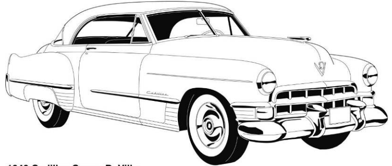
1949 Cadillac Coupe DeVille

Following in the tradition of celebrating a theme at the Annual Fall Car Show at Capitol Cadillac, this year's theme will be Dazzling DeVilles . Specifically, DeVilles from the model years 1949-1970 will be the honored cars at the show to be held on Sunday October 30th in Greenbelt, MD. These were among Cadillac's most popular models during the period when Cadillac became the undisputed sales leader in the luxury car market.