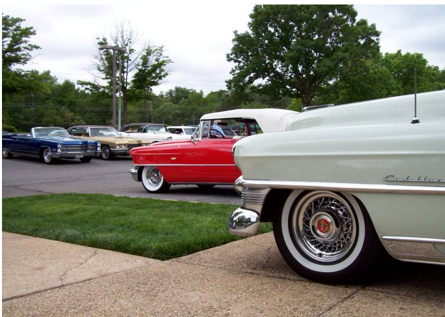
The clean whites were on display!