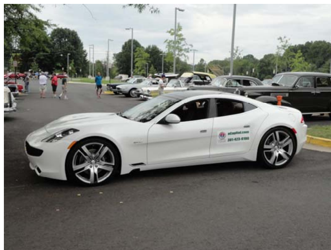
A 2012 Fisker from Capitol Cadillac, who also sell Fiskers