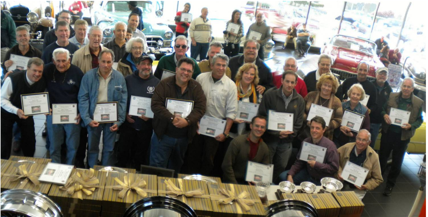
Colossal Convertible Owners with their Certificates of Appreciation