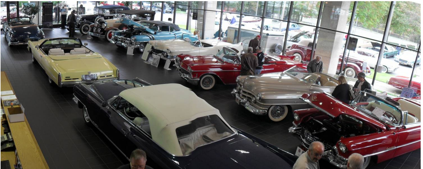
Six decades of Colossal Convertibles