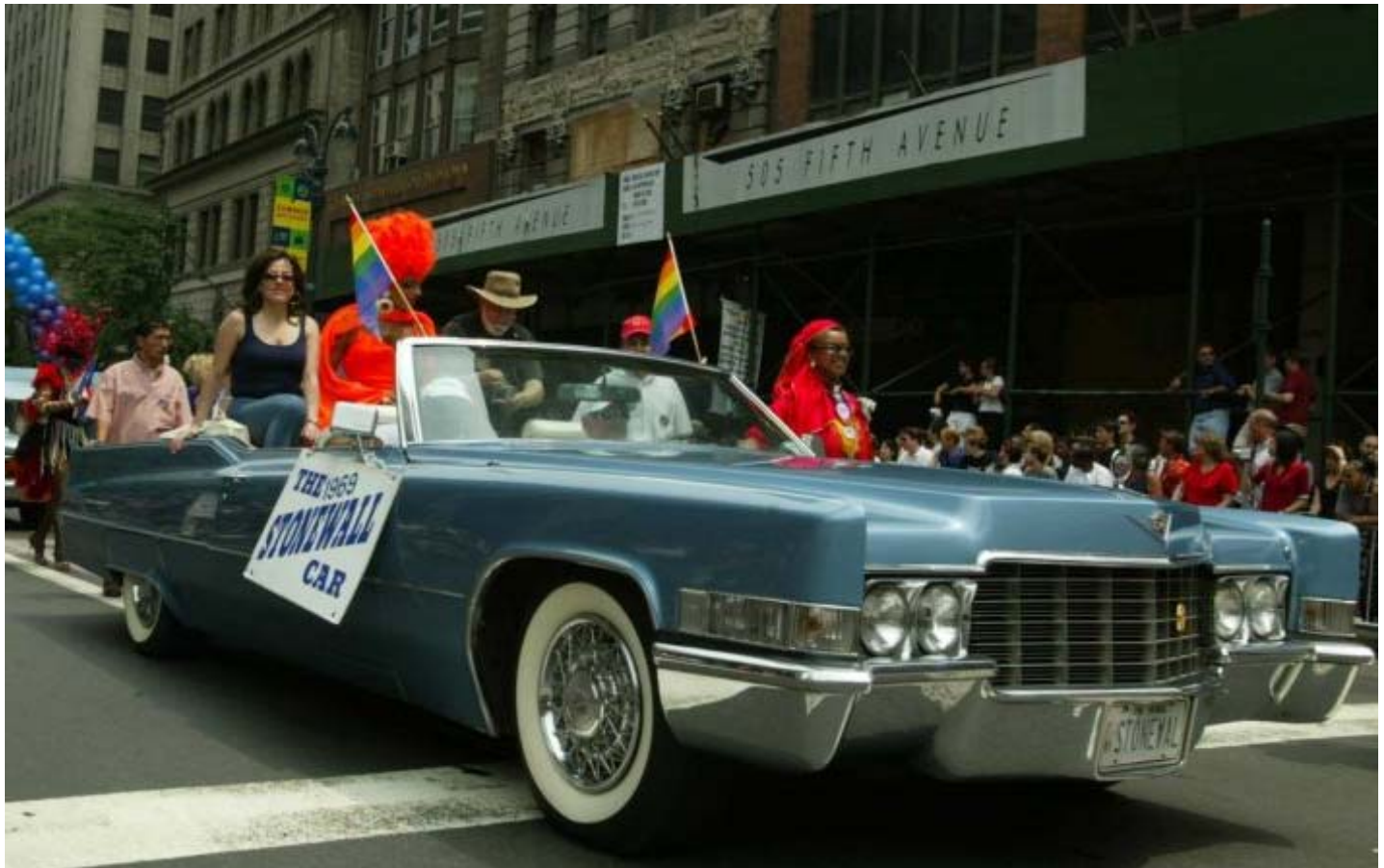
The Stonewall Cadillac leading the New York City Gay Pride Parade June 2003