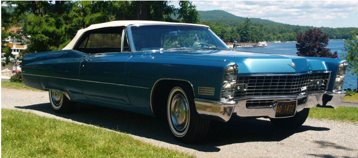
Chuck & Debbie Piel's 1967 DeVille Convertible 79K miles

Congratulations to the following members whose Cadillacs recently hit a 1,000 mile milestone.