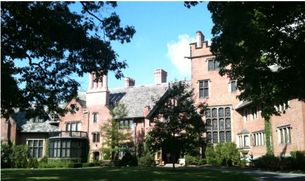
Seiberling home – Stan Hywet Hall