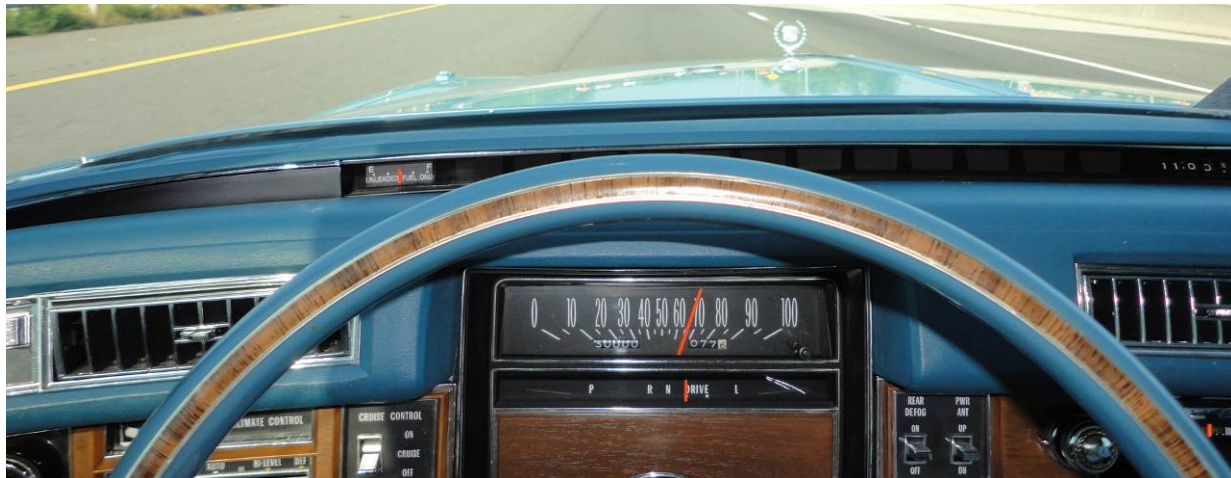
Lynn Gardner's 1975 Sedan DeVille 30K miles