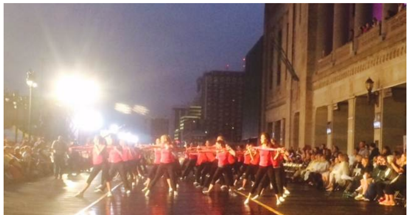
Miss America Outstanding Teens perform under the TV lights at Boardwalk Hall