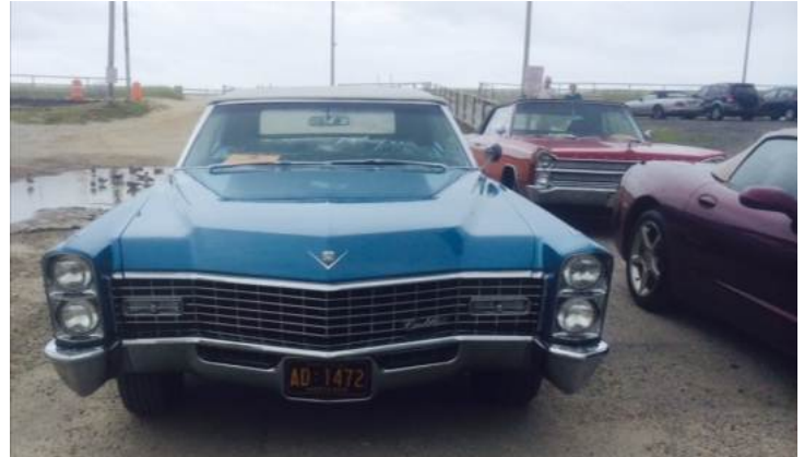
Our Marina Blue '67 waiting to line-up for the parade