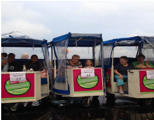
"Box Seats" on the Boardwalk