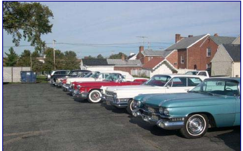
Bassett's Restaurant Poolesville MD