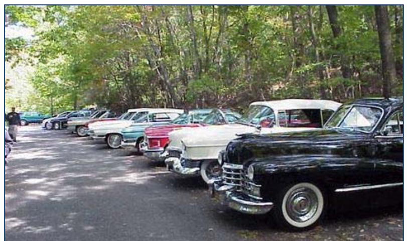
Sugarloaf Mountain Dickerson MD