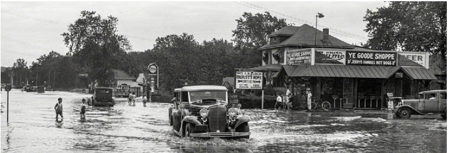
Washington, D.C. or vicinity? The flooding aftermath of the "Chesapeake-Potomac" hurricane of August 1933 Harris & Ewing glass negative

1933 HURRICANE SLAMS D.C. SUBMITTED BY DAVE ON FRI, 07/04/2014 - 12:19 PM. http://www.shorpy.com/node/18093