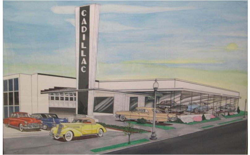
Capitol Cadillac 1260 22nd Street, N.W. Washington, DC 20037 1934-1979

To celebrate that milestone occasion, we gave special honors this year to those cars sold new by Capitol Cadillac from its old location in Washington, D.C.: that is, cars sold new by Capitol in 1979 and before. One can think of these cars as the alumni of this dealership, back for a homecoming celebration, and they were the cars highlighted in the prime locations inside the showroom. Also included in the special honors category were two other participating Cadillacs, from the 1934 model year, present in the showroom because they represented the year of the founding of Capitol Cadillac.