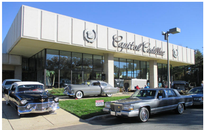
Capitol Cadillac 6500 Capitol Drive Greenbelt, MD 20770 1979-Present