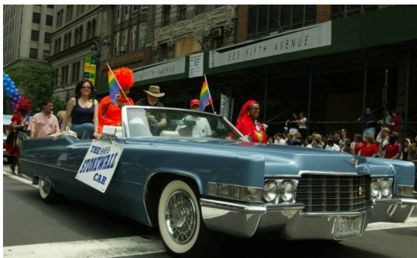
The Stonewall Cadillac leading the New York City Gay Pride Parade in June 2003