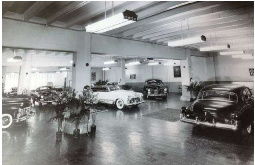
Capitol Cadillac Showroom circa 1948

In addition, the building provided a large display room to showcase more than a dozen new Cadillacs and LaSalle's, and a “dead storage department so that owners who desire, on leaving the city for an extended time, arrange to leave their cars in the care of the company.” In the shop, the new dealership installed “all of the newest labor saving equipment, designed especially for service work on these cars”.