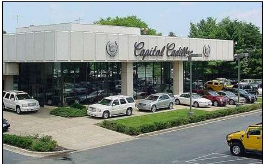
Capitol Cadillac 6500 Capitol Drive Greenbelt, MD 20770