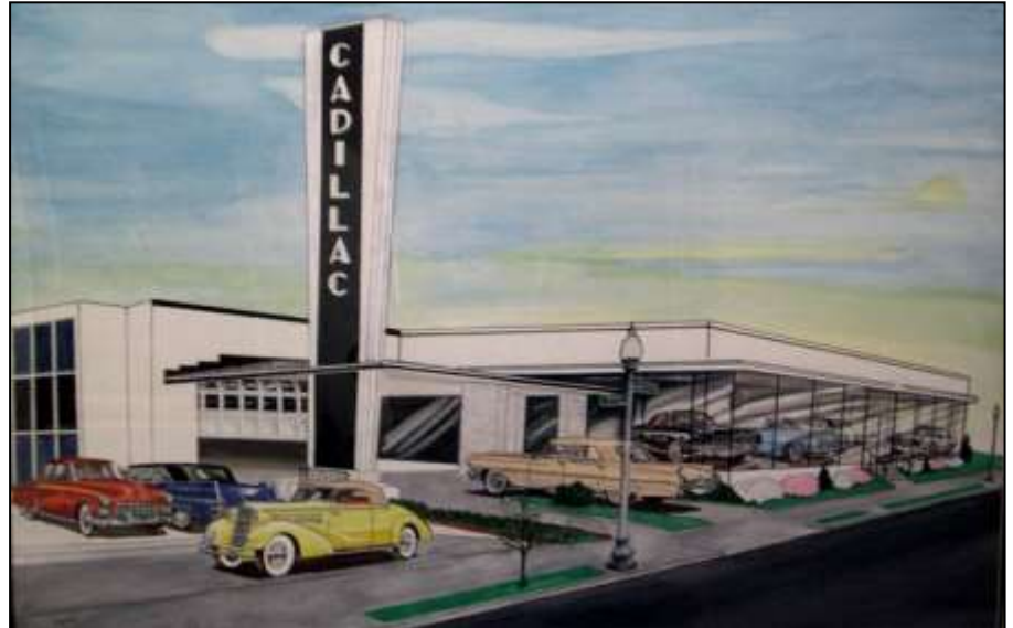
Capitol Cadillac 1260 22nd Street, NW Washington, D.C. 20037 Dealer Code 426519