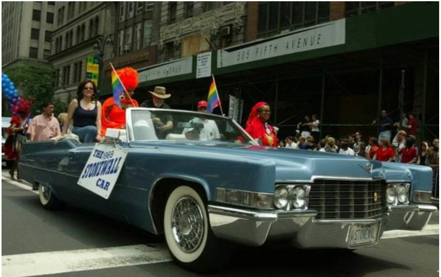
The Stonewall Cadillac leading the New York City Gay Pride Parade June 2003