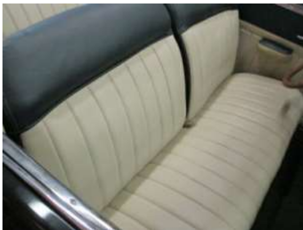
Interior view of Code 85A green and beige leather seats

It also shows that the car was delivered with the Hydra-Matic transmission (equipment code T), US Royal black wall tires (code R) and specified no running boards (code V). Interestingly, all of the options that are on the car did NOT show up on the build sheet.