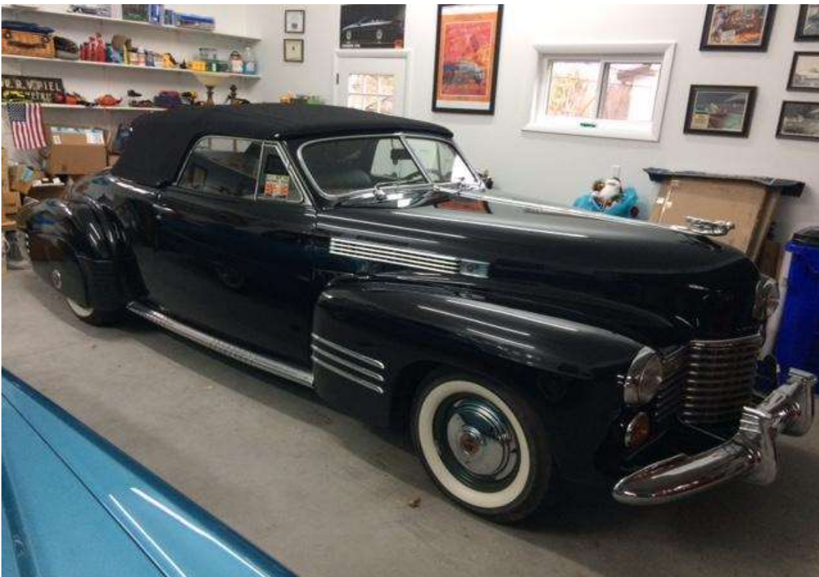
Our new '41 6267D Convertible Coupe, aka "Black Beauty"