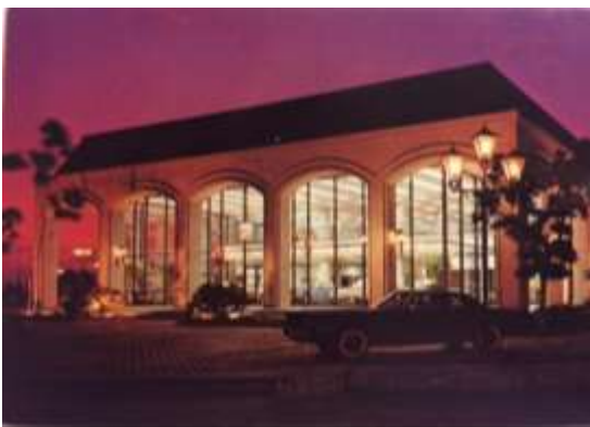
Martin Cadillac, 12101 West Olympic Blvd., Los Angeles c. 1976

This seems like the kind of place where you leave the car while going to work, so perhaps the first owner had a downtown office or residence on the famed Chicago "Gold Coast?"