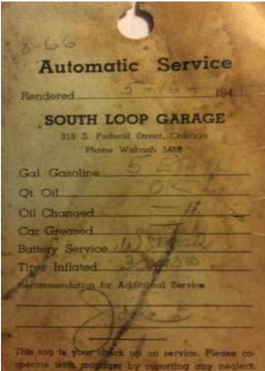
Gas Service Ticket dated 5-16-41 found in the glove box