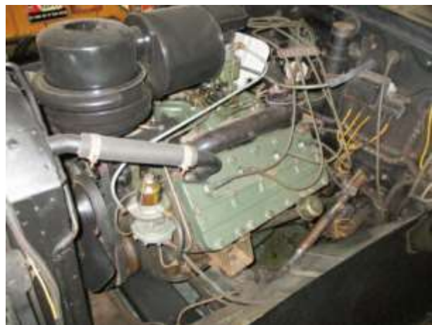
View of "Black Beauty's" engine bay