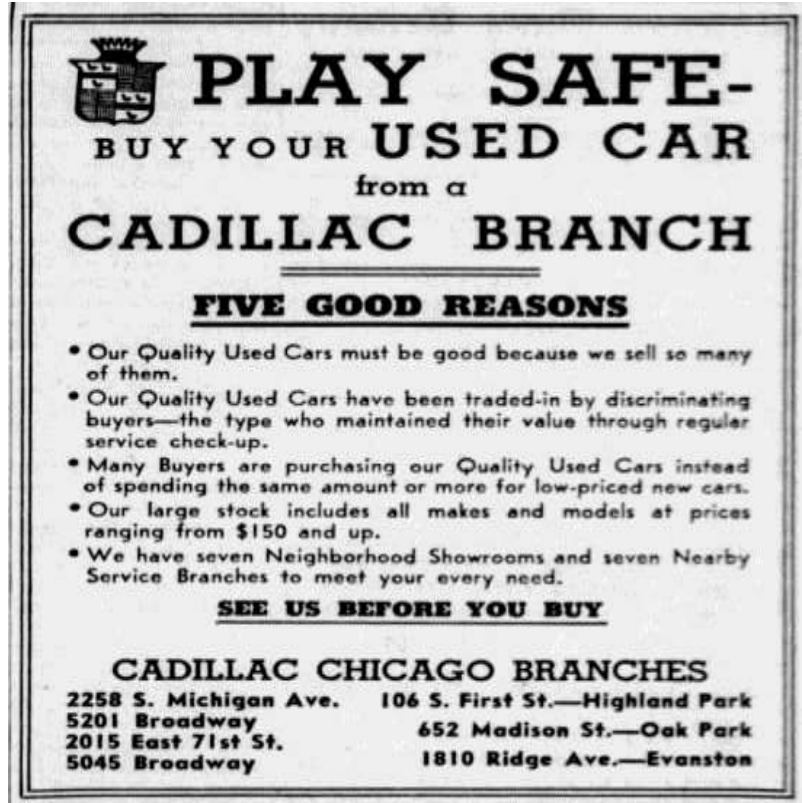
Cadillac Chicago "Branches", defined in a March 14, 1941 Chicago Tribune ad