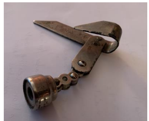
The item that was found in my radiator top tank. It is based on the second lock type that Hermann Schlaich patented.