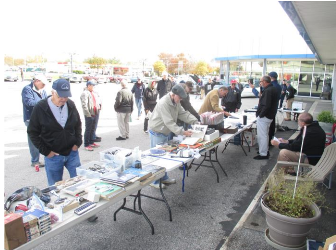
Many thanks to those who donated and purchased items at the auction, which yielded just under $400 for the club