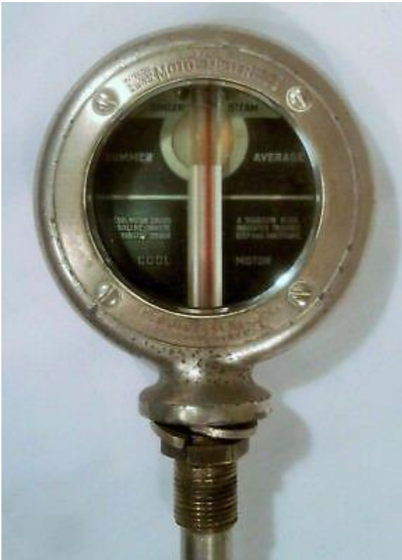
A typical Moto-Meter

SCHLAICH BOYCE MOTO-METER LOCK and on the straight arm the lettering appears to read: MANUFACTURED BY QUEENS TOOL & DIE CO., INC. LONG ISLAND CITY, NEW YORK, USA Part of the last was obliterated by a stamp or otherwise.