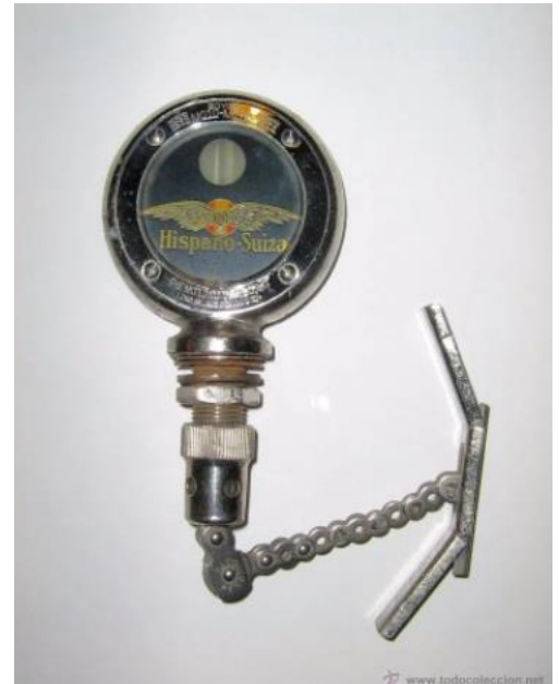
How another style of Moto-Meter lock attached to a Moto-Meter. When unfolded below the filler neck, the hinged arms of the lock prevent removal of the Moto-Meter.