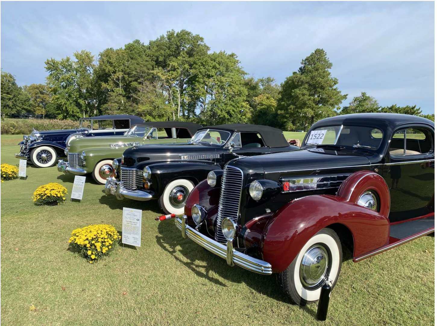
A fine line-up of Classic Cadillacs