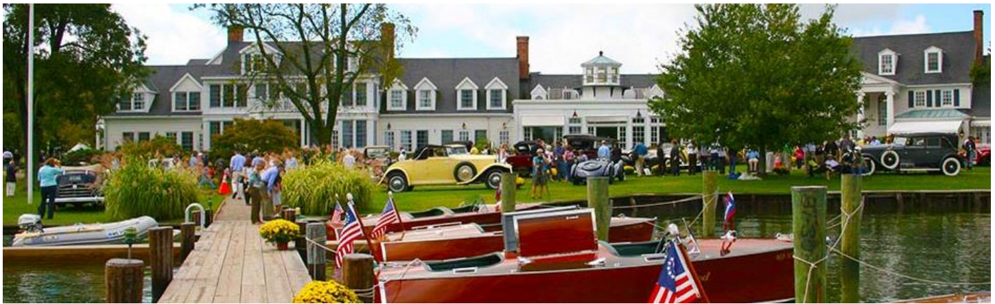
Talbot Country Club is the venue for the 15th Annual St. Michael's Concours

Via our 1941 Cadillac Convertible Coupe, we were fortunate to be invited to participate in the St. Michael's Concours d'Elegance ("Concours") on September 23-25, 2022, at the Talbot Country Club in Easton, MD. This was the 15th running of the Concours that has become one of the most prestigious classic car events in the Mid-Atlantic region.