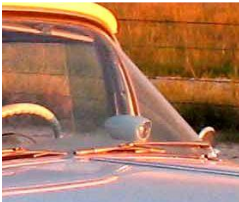
Eldorado #87 with Autronic Eye

Larry's comments: By all appearances, the two cars are identical, even down to their inverted upholstery color pattern, but with one exception: Autronic Eye. Compare their dashboards below.