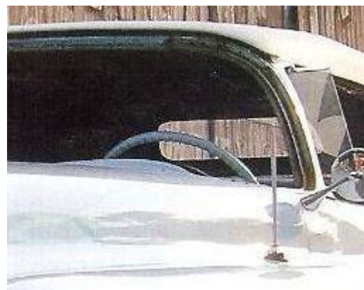
Eldorado #529 with no Autronic Eye