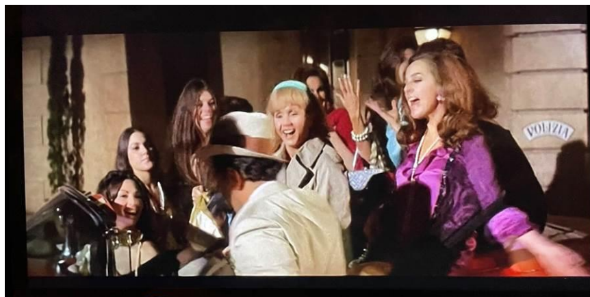
Screenshot: How Sweet it Is! (NOT Eldorado #55) Debbie Reynolds (ctr.) with Friends in an Unknown 1953 Eldorado

We all go nuts for the Cadillacs we love when they appear in movies and TV, and the Internet Movie Car Database (IMCDB) points us to them. After looking into the Dragnet Eldorado, I searched for more movie '53s. IMCDB turned up a white one in the movie L.A. Confidential and another red one in a movie called How Sweet it Is! I rented the second one for $4 and saw Debbie Reynolds and a slew of professional ladies of the night with their benefactor pile into a red '53 Eldorado near the end of the movie (see below). I thought I'd found #55 again because this film and the Dragnet episode were just a year apart, and the Eldorados were both red. Directors might pass the same car around from studio to studio. But that was a false alarm. Eldorado #55 never had an all-red interior like the car in this movie, so no cigar.