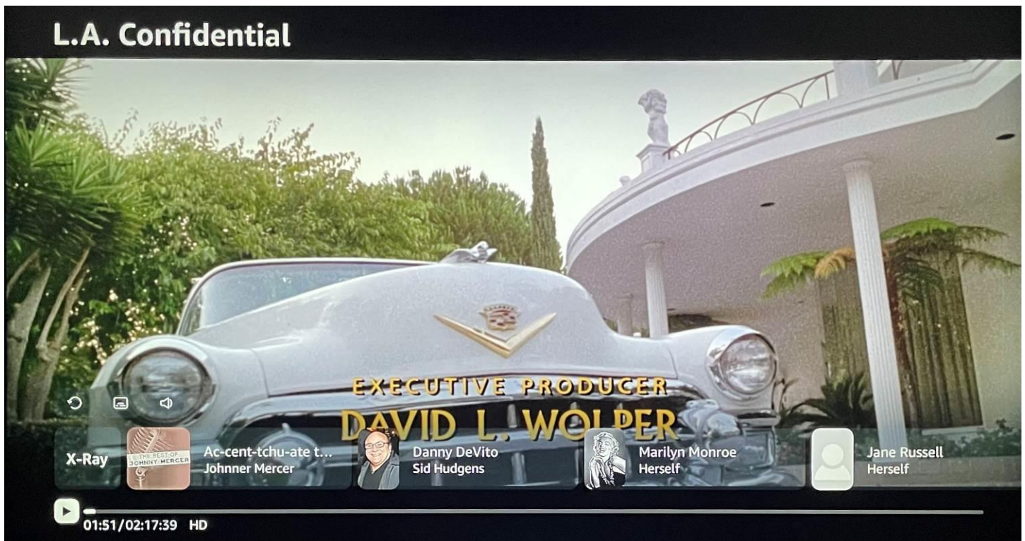
L.A. Confidential Screenshot Eldorado #55 on Set

Trivia: The LAPD drove Fords in the movie, as usual. This time 1951s, but some of the heroes drove Chevs.