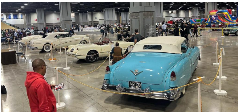
Our display featured four notable Motorama vehicles and was very well attended