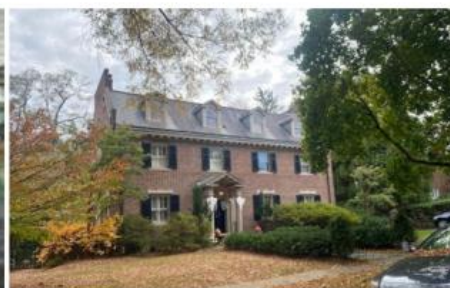
The Goldsborough house as it looks today