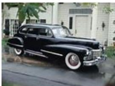
1942 Cadillac Series 67 Limo

The first item is a Chesapeake Cadillac Repair Order, dated 12-9-42, for a 1942 Series 6719 Sedan owned by Mr. Felix Goldsborough at 309 Somerset Rd. in Baltimore. (See next page.) The car is identified as a Series 6719, Serial #9380161 with 12,995 miles on the odometer. It includes rotating tires and "remove slip covers from backseat". [I remember my grand-parents rotating slipcovers on their living room sofa!] This RO included adding 7 gallons of gas for a total of $1.57! It also included lubrication and maintenance items covered under the Cadillac Lubrication Agreement. A complete checklist was attached to the back of the RO detailing 17 maintenance steps/operations.