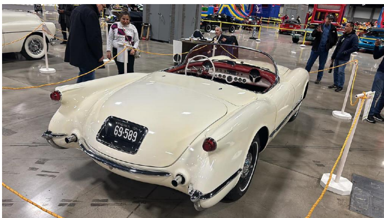
Dan Lewandowski's '54 "rescued" Corvette. Dan is pictured left at center to the rear of the car.

It takes a Corvette expert to visually tell a 1953 and 1954 Corvette apart. All 1953s, and over 90% of 1954 Corvettes, were Polo White with a red interior. Dan's 1954 Vette, #3299 of 3600 built, was rescued from being parted out and is now an aesthetically authentic 1954 resto mod. The original Stovebolt straight six-cylinder engine with triple carbs was unsalvageable, so Dan installed a 1961 283 CID Corvette engine with two four-barrel carburetors and a Muncie four-speed transmission.