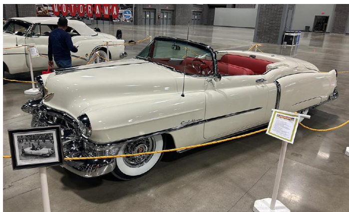
"Before" and "After" results of Larry Good's Eldorado #352 are very compelling