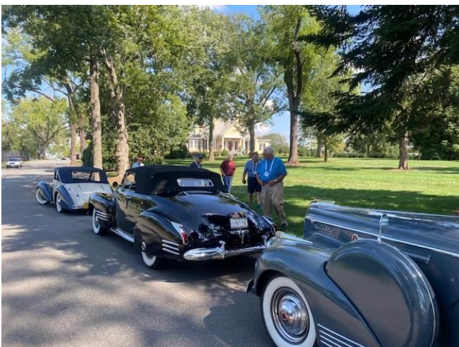
Our last stop – Woodberry Forest School