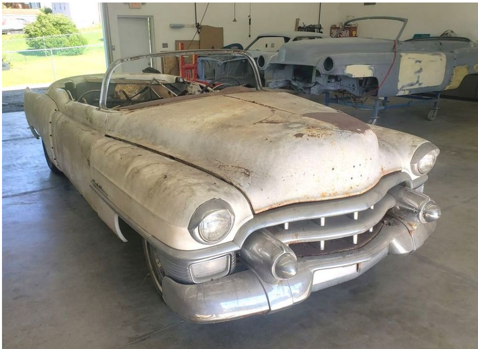
Eldorado #533, last 1953 Eldorado issued by the Fleetwood Fisher Plant, undergoing restoration at Cole's Classics in Ohio; See "Eldorado of the Month," Caddie Chronicle , Dec 2023