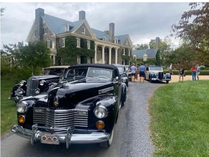
Tour cars lined up in front of the Ayrshire Farm Mansion, circa 1820

All told, our tour covered 556 miles, and with our travel to and from the tour HQ, our total mileage was just over 800 miles. The entire tour was on mostly two-lane roads with breathtaking scenery of all the farms and the Blue Ridge Mountains.