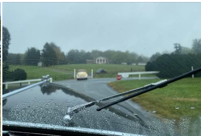
Our rainy entry into Montpelier, President James Madison's estate