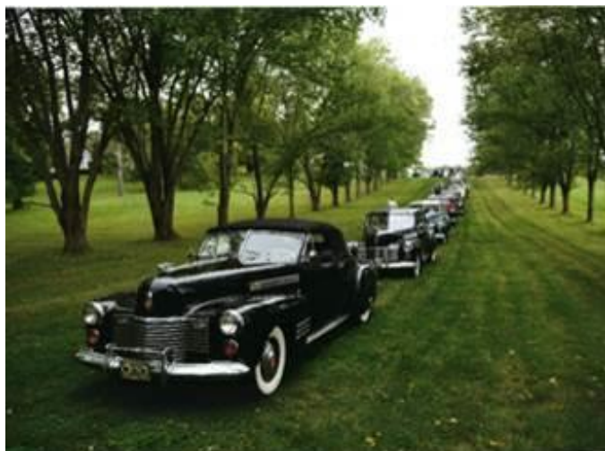
Our '41 leads the procession as the cars approach Ayrshire Farm in Upperville