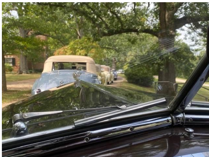
Following the '41 Packard Darrin into Bollingbrook Farm

All told, our tour covered 556 miles, and with our travel to and from the tour HQ, our total mileage was just over 800 miles. The entire tour was on mostly two-lane roads with breathtaking scenery of all the farms and the Blue Ridge Mountains.