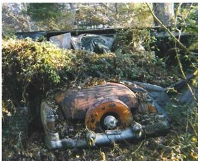
FW 255 - Before in the US