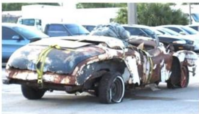
FW 430 - Worse than a fire victim with all but the block cancered through; extreme restoration