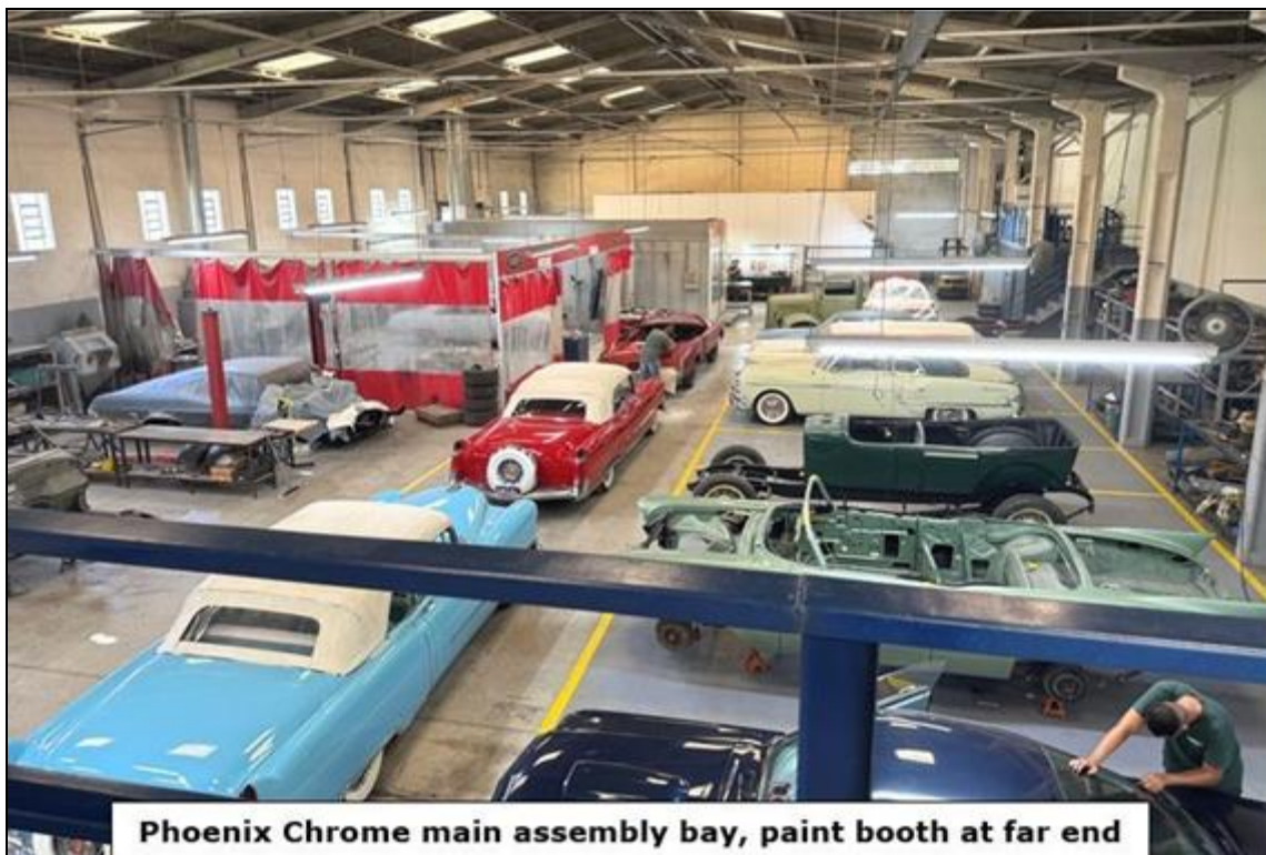
Phoenix Chrome main assembly bay, paint booth at far end

This article describes Phoenix Chrome more in the form of gallery than as text because of the thousand-word rule. We'll look at Marcus' personal collection too. Cadillacs are everywhere!