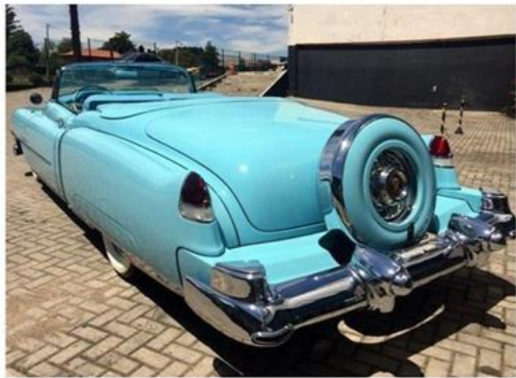
After in Brazil