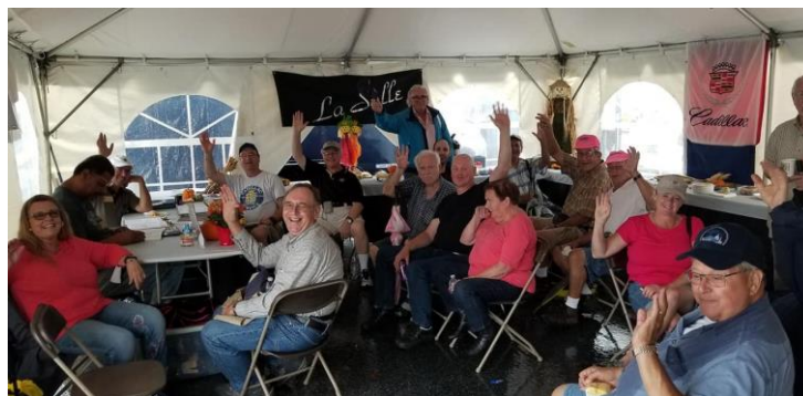
Hershey attendees enjoying the CLC tent October 2018

would take a shift in the tent if invited personally, at least 10 members raised their hands. We'll discuss this at our upcoming officers' meeting. There may be a way yet to save the tent.