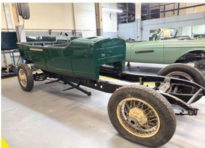
Foreground: 1929 Cadillac Phaeton V-8 Background: 1957 Eldorado