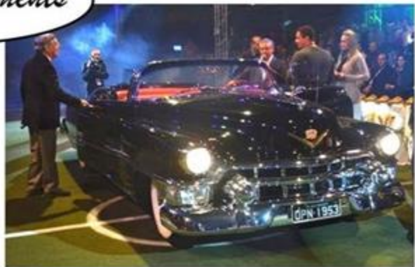
FW 214 - Brazil, Araxá Show Winner