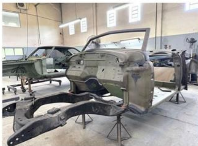
Competition from Mopar: 1946 Chrysler Town & Country