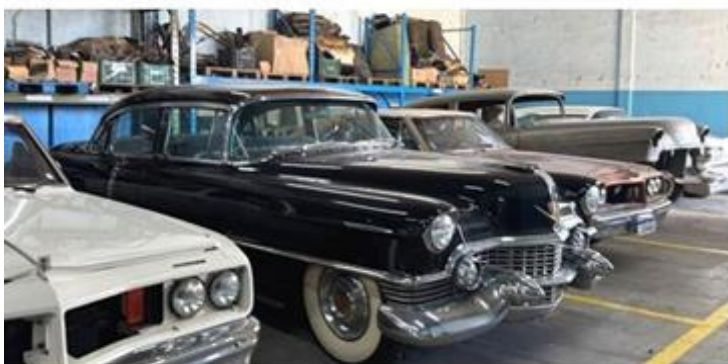
1954 Fleetwoods: Foreground in for partial restoration; background for total restoration