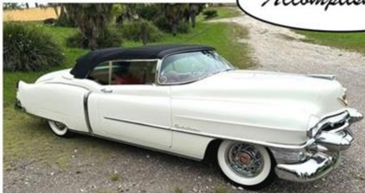
FW 25 - See p. 16, Caddie Chronicle, Feb. 2025