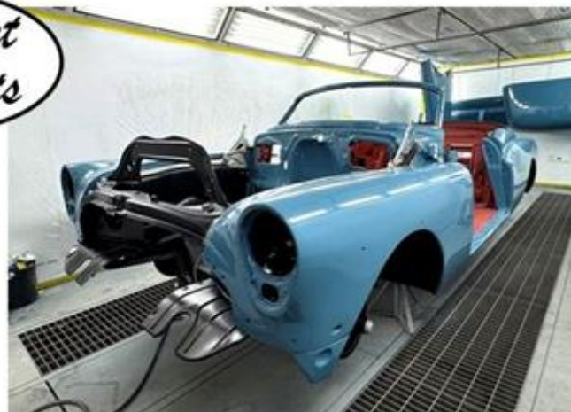
1953 Buick Skylark - one of 3 GM halo cars with Cadillac Eldorado and Olds Fiesta