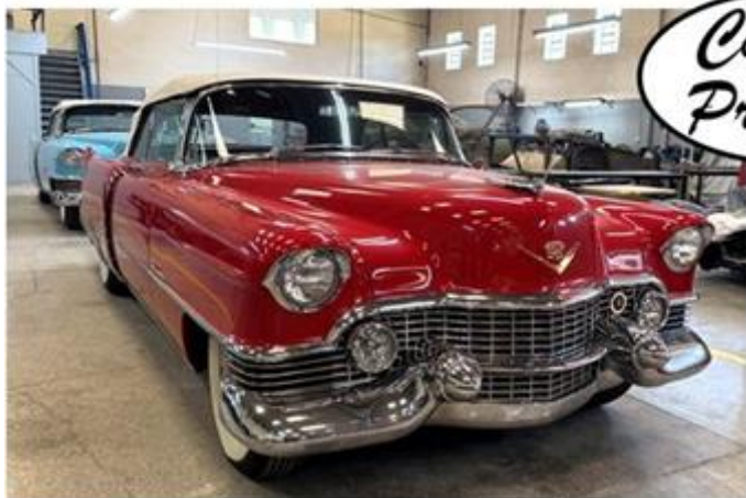
1954 Eldorado followed by 1955 Series 62