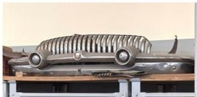
The rest of the Skylark