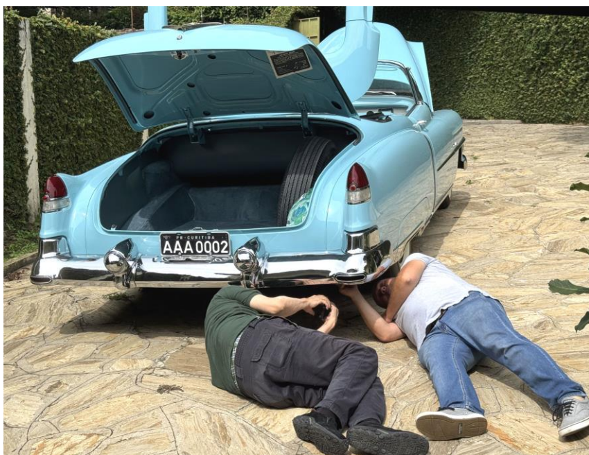
Interviewing Eldorado #6