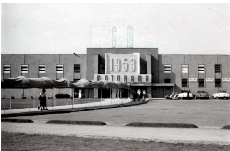
Entrance to Fair Park exhibition hall; two Buicks and a Cadillac parked out front; what kept the "GM" from tipping off the roof in a wind?