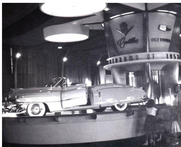
Five-car display stand, one turntable for each GM marque; display built and torn down at each Motorama site

At the end of June after its second Motorama in Kansas City, Cadillac called FW 6 back from show service (see Return for Credit Notice below). Then on August 18 it was invoiced from the factory for public sale and sent to an illegible destination. Here's where the story shifts continents.