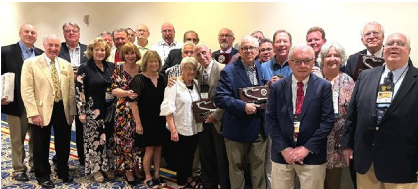
Potomac Region Family Photo, 2024 Grand National